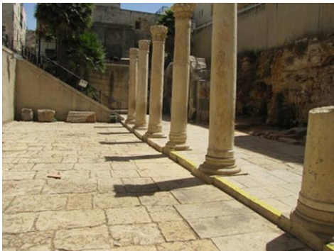
The street is to the left and the colonnaded sidewalk is to the right with shops along the sidewalk.