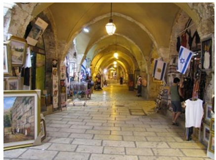
Today modern shops fill portions of the ancient cardo.