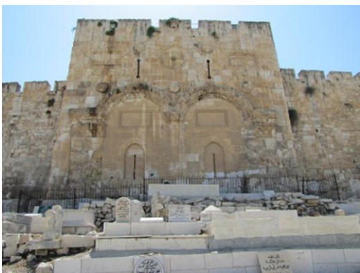
Golden (Eastern) Gate