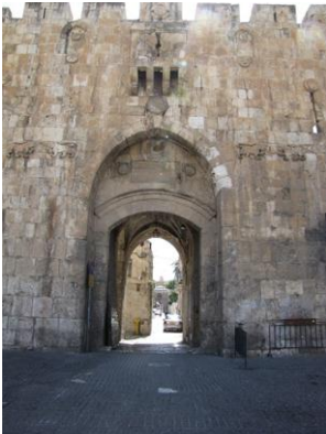
Lions' (Stephen's) Gate