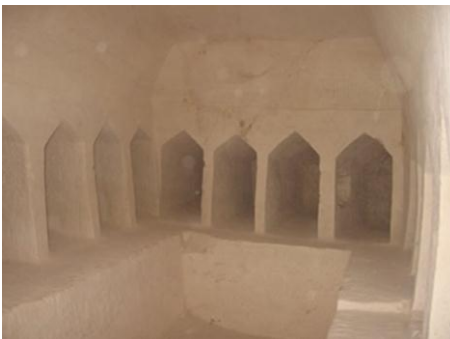
Sidonian Burial Caves from 200 BC with gabled niches for the dead.