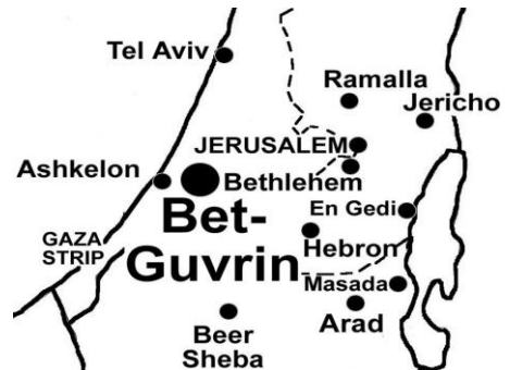
Inscriptions and paintings show life and art from 2,200 years ago.