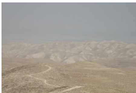
View of the area where Mitzpeh Danny is located in the West Bank