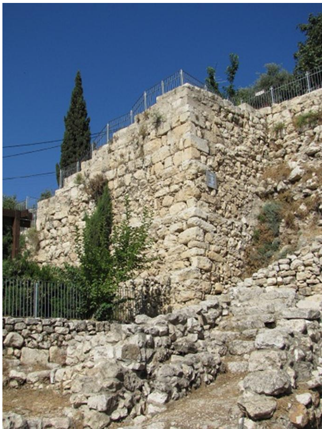
A portion of the wall Nehemiah built in 445 BC. A portion of this wall was rebuilt by the Hasmoneans. This is located on the east side of the City of David below the palace and next to the Jebusite's Stepped Stone Structure.