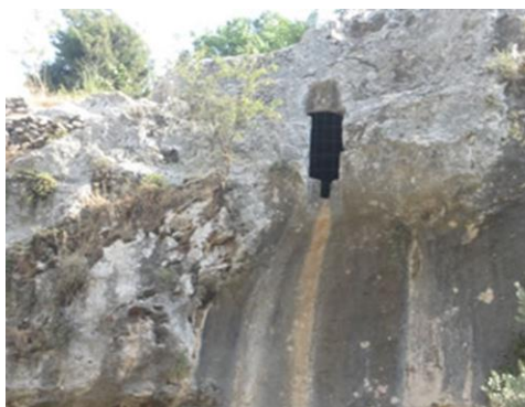
Tomb in Hinnom Valley