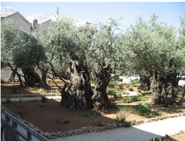
The Garden of Gethsemane