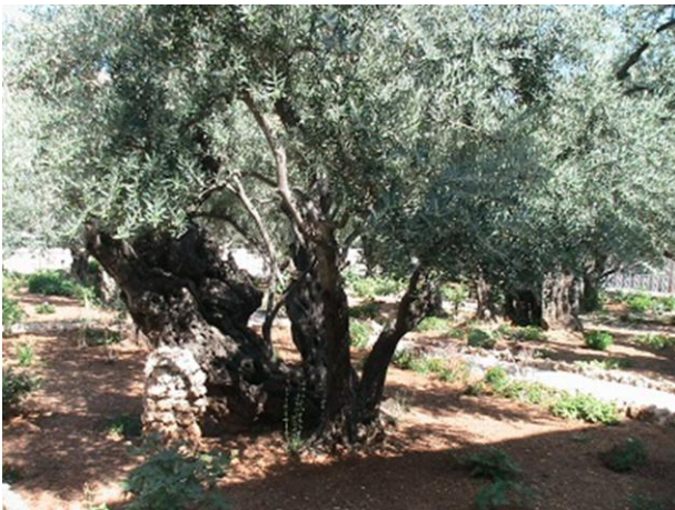
An ancient olive tree grows in the Garden of Gethsemane (1500-2000 years old)

equipment against the city of Jerusalem. This means it is unlikely that any of these exact trees were here at the time of Christ in 30 AD, but scholars do estimate the age of these trees to be anywhere between one and two thousand years.