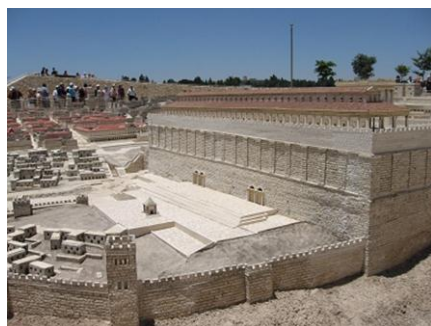
A photo of a model showing the view of the southern wall of the temple from the southeast.