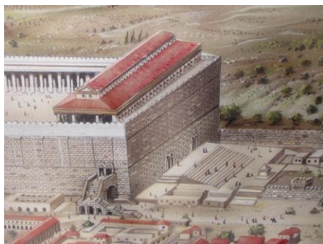
A drawing viewing the southern wall of the temple mound from the southwest.