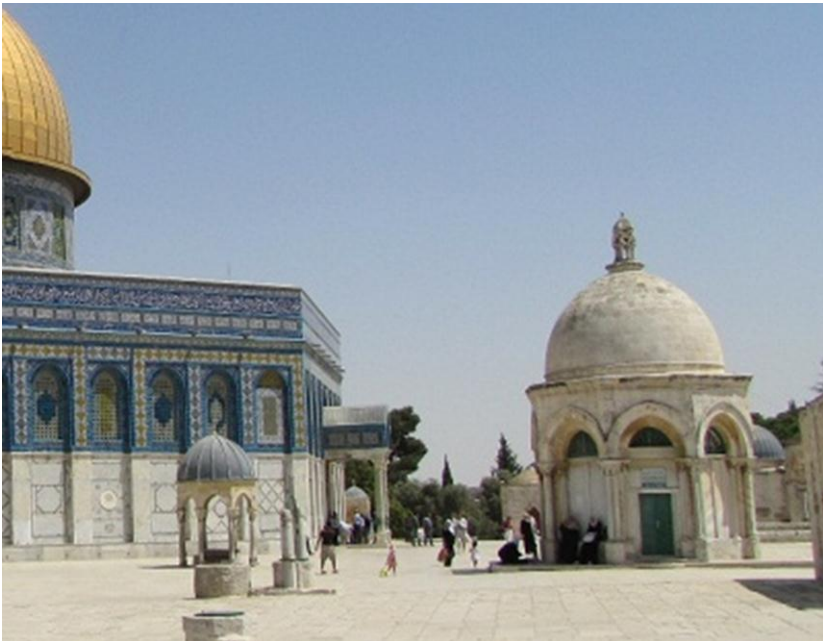
The Dome of Ascension - According to early Muslim tradition Muhammad ascended into heaven from here.

Interpretation of Muhammad's night journey, described in the Koran in Sura 17:1: "Most glorified is the One who summoned His servant (Muhammad) during the night, from the Sacred Masjid (of Mecca) to the farthest place of prostration, whose surroundings we have blessed, in order to show him some of our signs. He is the Hearer, the Seer." But, Jerusalem is not mentioned in this passage, nor ever in the Koran.