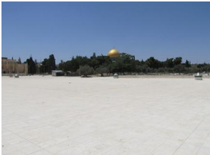
A view of the Temple Mount from the southeast corner