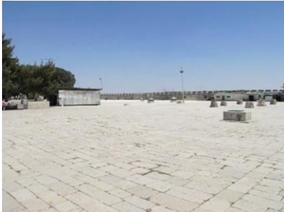
Looking at the southern wall with the Cup fountain behind and the Al-Aqsa Mosque to the right. Herod's Temple Mount stones are about 3 feet below these.these pavement stones.