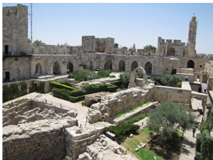
Inside the Citadel

Erroneously called the Tower of David is a Muslim minaret located in the Citadel. It is a familiar landmark and