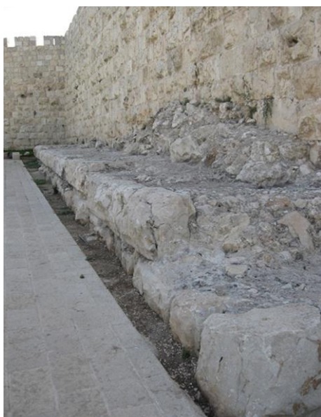
The Herodian Aqueduct on the south wall of the city (#1 in diagram above)