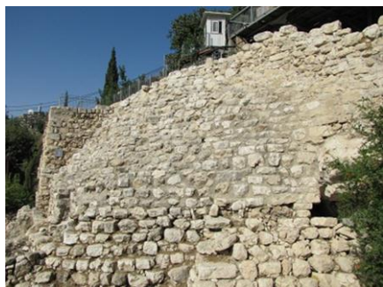
Massive stepped podium for the Canaanite/Jebusite palace/fortress dated 1200-1000 BC. Used by David.