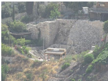
The Stepped Stone Structure (Jebusite Wall) viewed from Mt. Olives