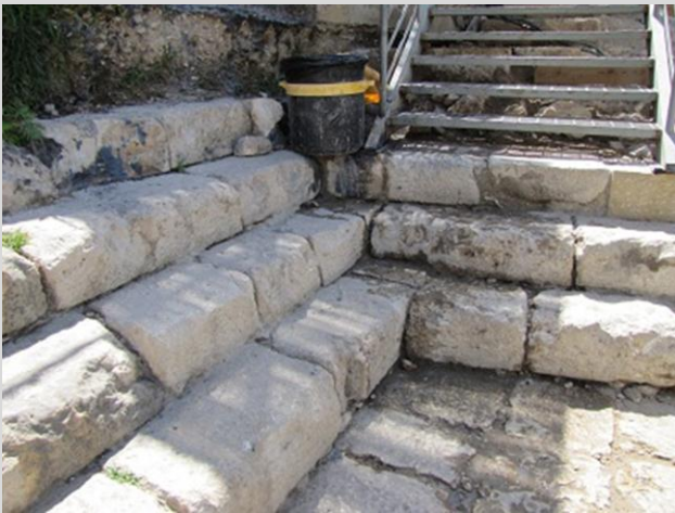
One of the four corners of the Pool of Siloam.