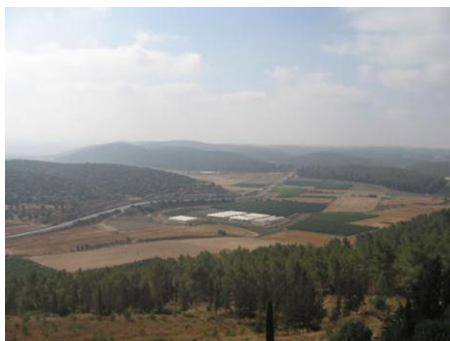
Socoh as seen from Azekiah looking over the Elah Valley