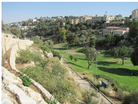
View of the green grass in the Hinnom Valley as seen from west side of Mt Zion near SW corner of Old City.