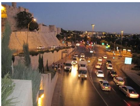
Looking down the Hinnom Valley near the Joppa Gate.