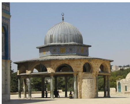
The Dome of the Chain