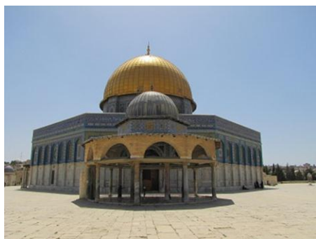
Dome of the Chain sets in the location of the altar of burnt offering.