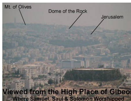
A view looking south at Jerusalem from the High Place of Nabi Samwil as the Crusaders did in 1099 AD.