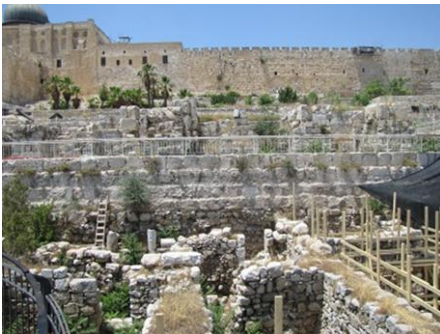
Looking north from the north edge of the City of David (Silwan)

This part of the city was always heavily fortified, as seen in Nehemiah 3:26, Isaiah 32:14 and Micah 4:8. Extensive building took place in this area from the days of David right up to the modern excavation of the Ophel just south of the Temple Mount.