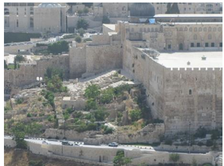
Looking west at the Ophel from the Mount of Olives over the Kidron Valley. (Temple Mount to right.)